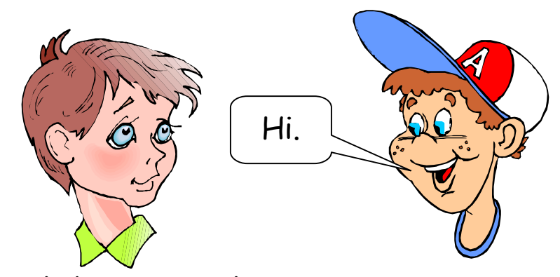
I wait until that person looks back at me.