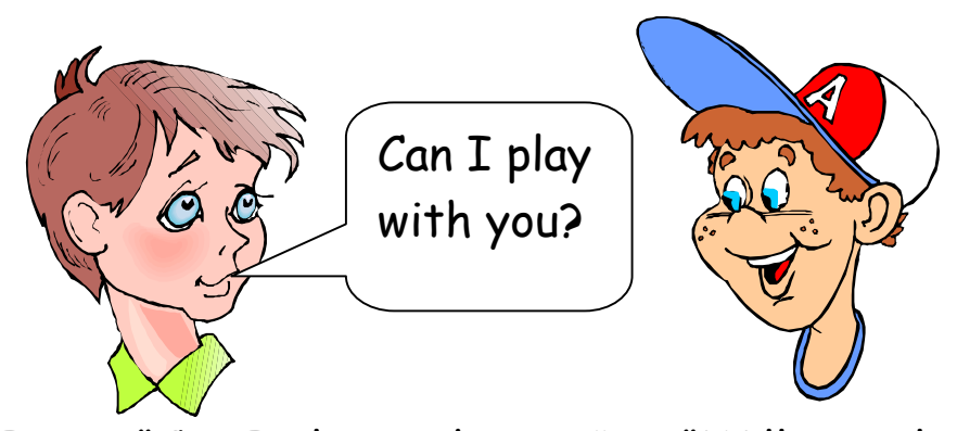
Then I say, "Can I play with you?" or "Will you play with me?"