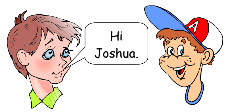
Next I say their name to get their attention.